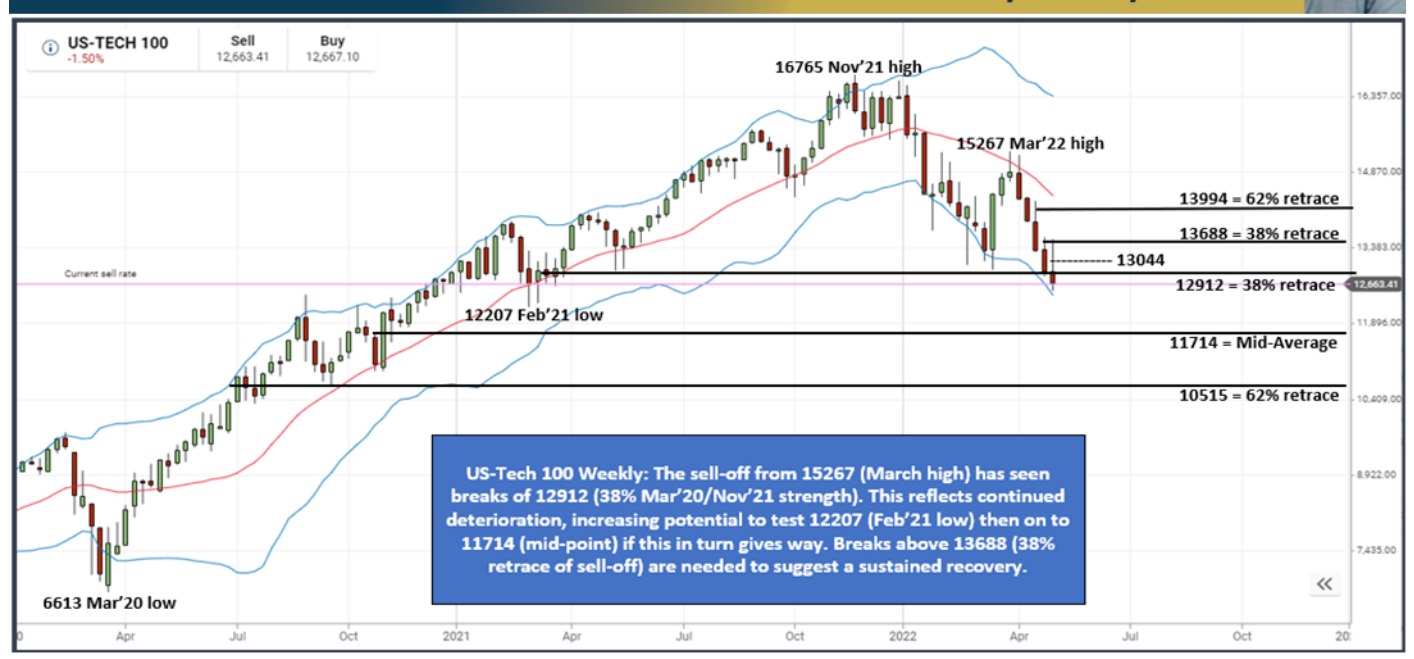
Step 3: Looking forward to the week ahead

Important events are coloured in bold red, all times are British Summer Time (BST)