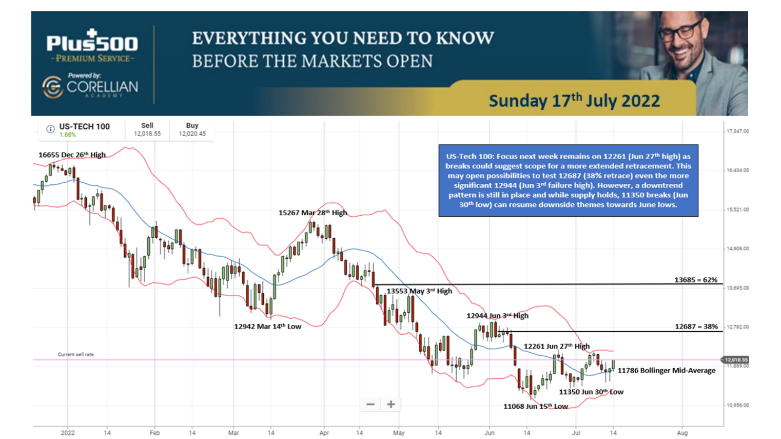
Step 3: Looking forward to the week ahead

Important events are coloured in bold red, all times are British Summer Time (BST)